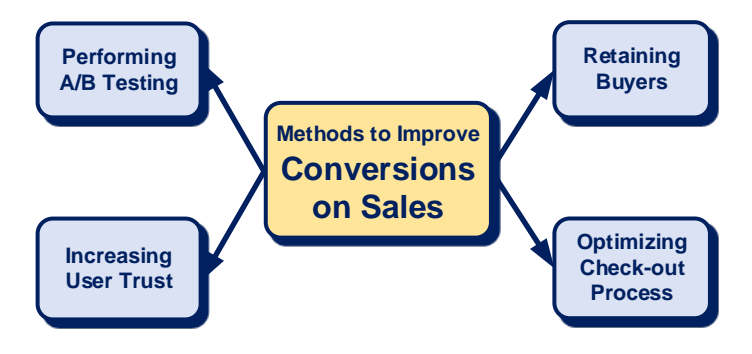
Fig. 3. Methods to improve conversions on sales.

The method of knowing about the success rate of the website with website visitors in context to design aesthetics, appropriate content, and working functionality is known as A/B testing. It provides the developer to test the variation over the page element or component that directly affect the actions or behaviour of the customer. A continuous iteration until capturing users' best possible version while testing is more effective since each hypothesis is developed based on the results of the previous hypothesis. Testing more consistently improve the overall design of the web so that end users could interact and engage more with the website [22] [23].