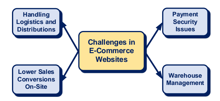
Fig. 2. Challenges in the e-commerce web space.

A successful "conversion" is one in which the user follows the Call to Action (CTA) and completes the steps that were required to be performed. For example, in order to get more email newsletter subscribers for a brand, a visitor on a website must have to enter his email address and name. Each successful subscription would be counted as a conversion in this case [15]. Similarly, a successful sales conversion for an e-commerce website is counted only when the visitor selects products, add them to the cart, make the payment transaction and complete the checkout process on the website.